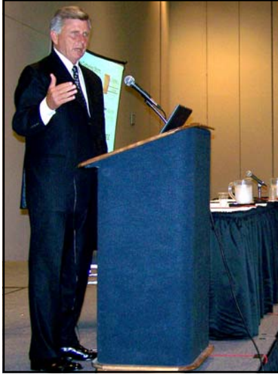
Governor Mike Beebe addresses members of the Arkansas STEM Coalition on the importance of aligning education with economic development.

Speaking before the Science, Technology, Engineering and Mathematics (STEM) Coalition in Little Rock September 5, Governor Mike Beebe called learning a lifelong process and said education and economic development are inextricably linked to one another.