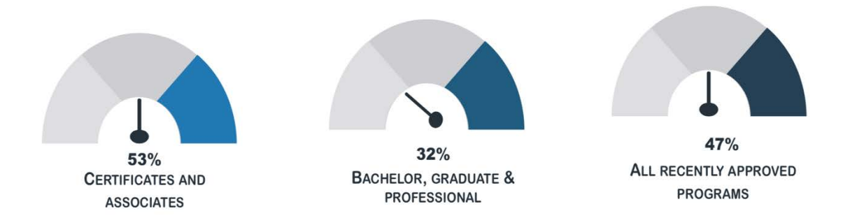
Figure 5.3:. Program Viability by Degree Type