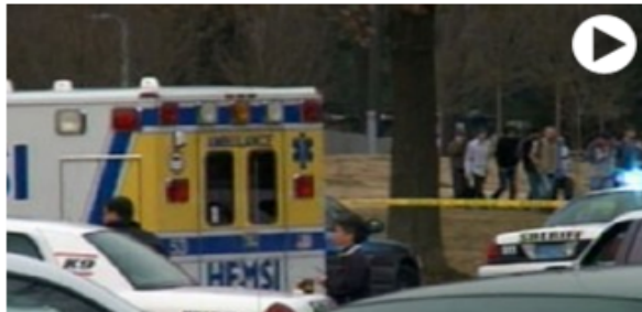
Just a Bad Day